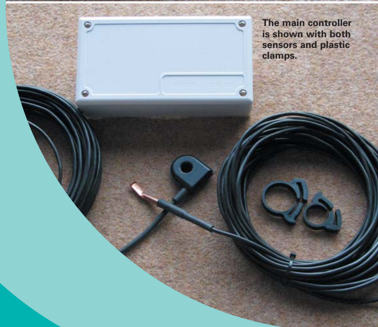
The main controller is shown with both sensors and plastic clamps.