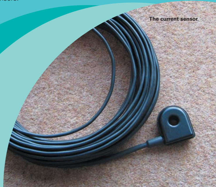
The current sensor.

For greater flexibility and ease of commissioning the multi sensor incorporates a load potentiometer and time potentiometer for each group of three current and each group of three temperature sensors.